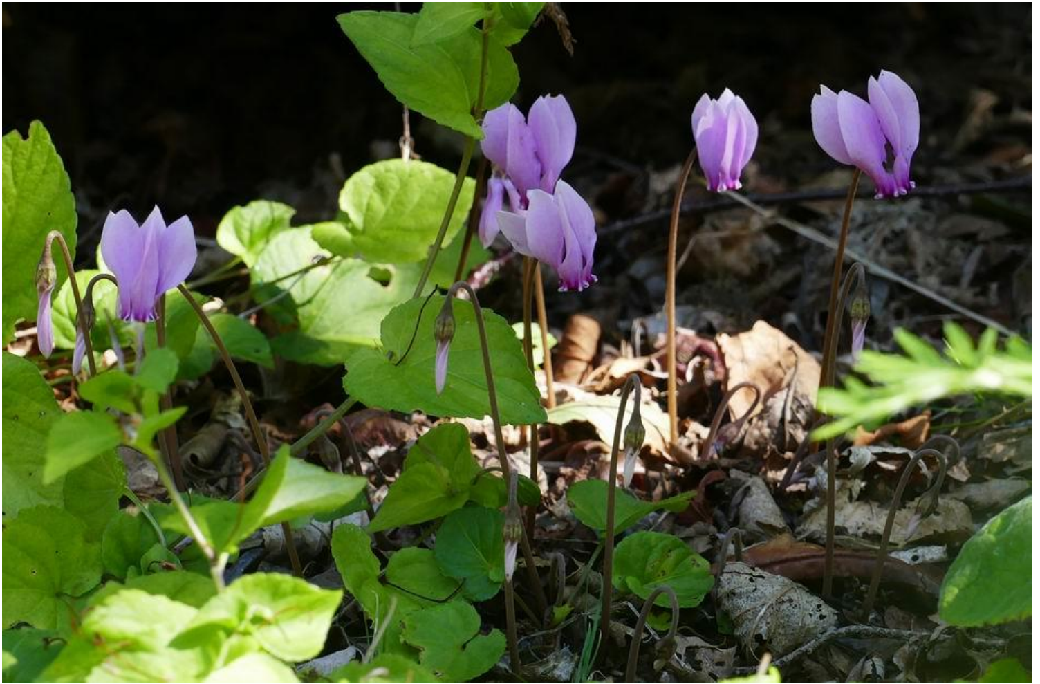
Cyclamen hederifolium flowers are unfurling all around the garden.