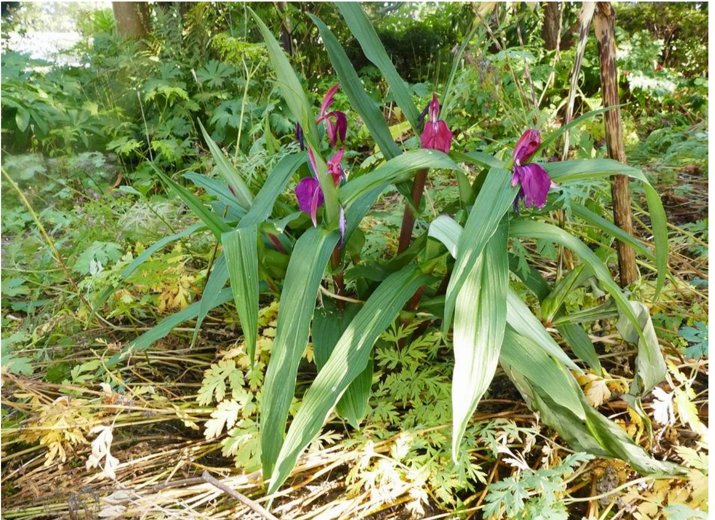
Roscoeae 'Harvington Imperial'