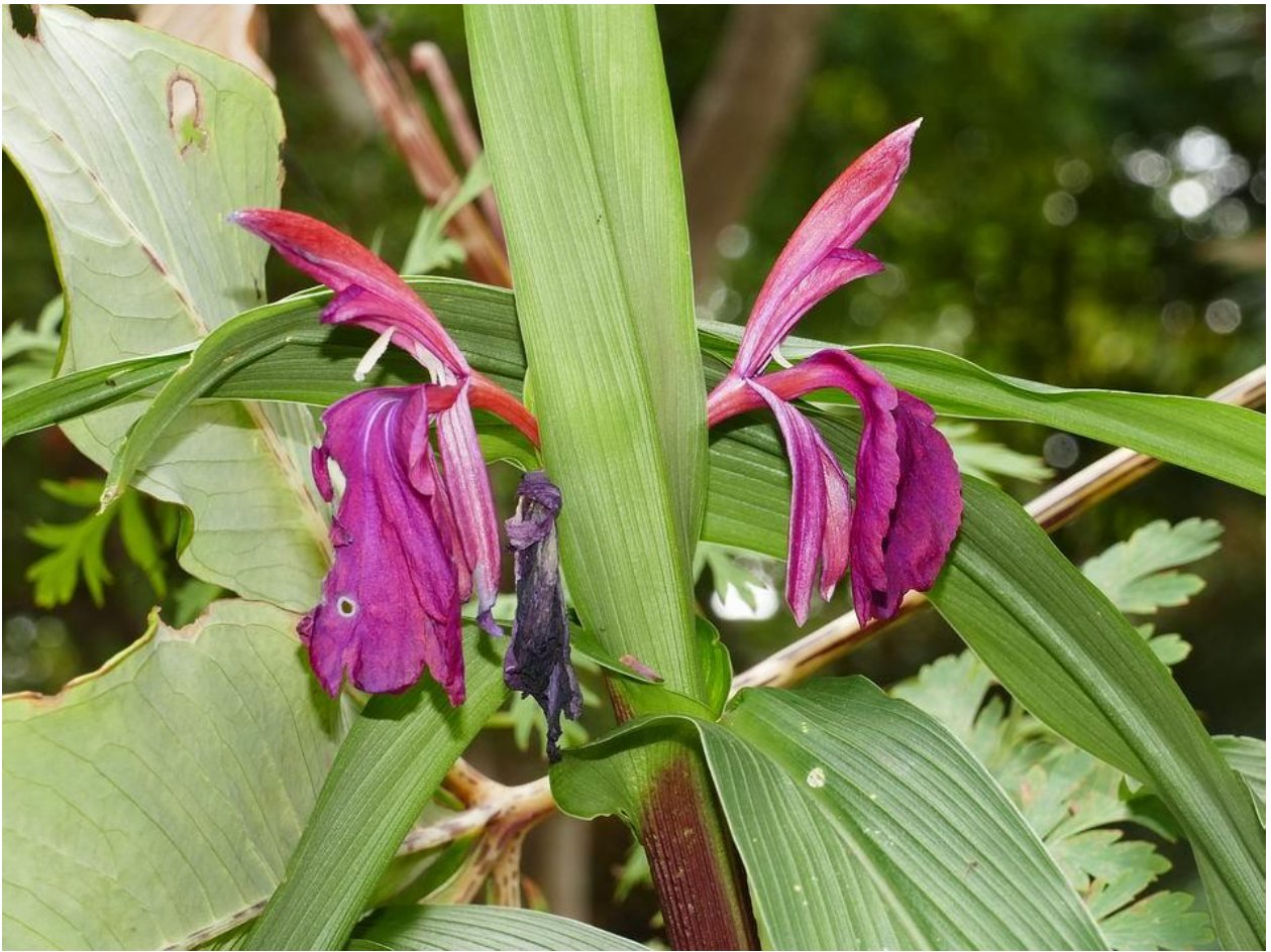
Roscoeae 'Harvington Imperial'