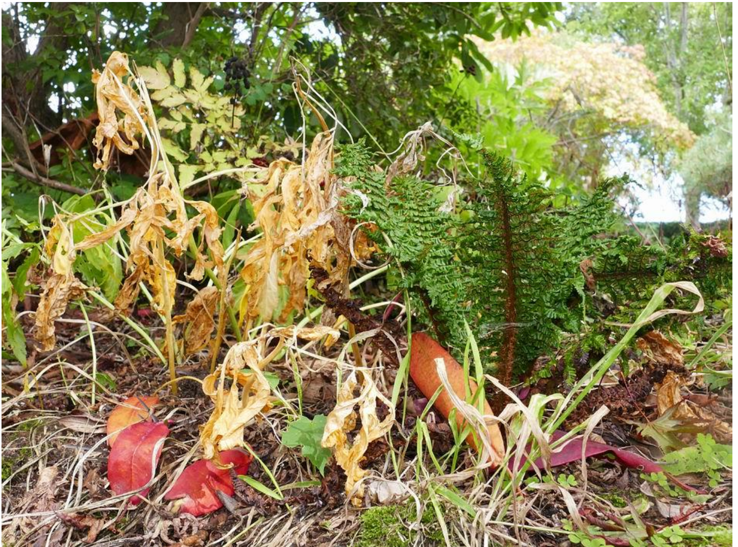
There is still decoration and interest to be found as the old growths change colour as they wither away for the year.