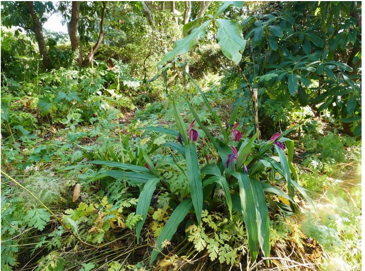
Roscoea 'Harvington Imperial' is another of those plants that takes a long lie through the first half of the year only rising through the retreating Dicentra foliage in August.