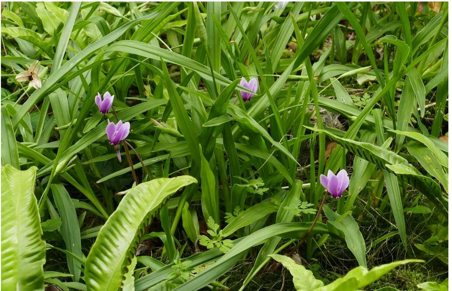
These Cyclamen hederifolium flowers are growing happily through some Roscoe foliage.