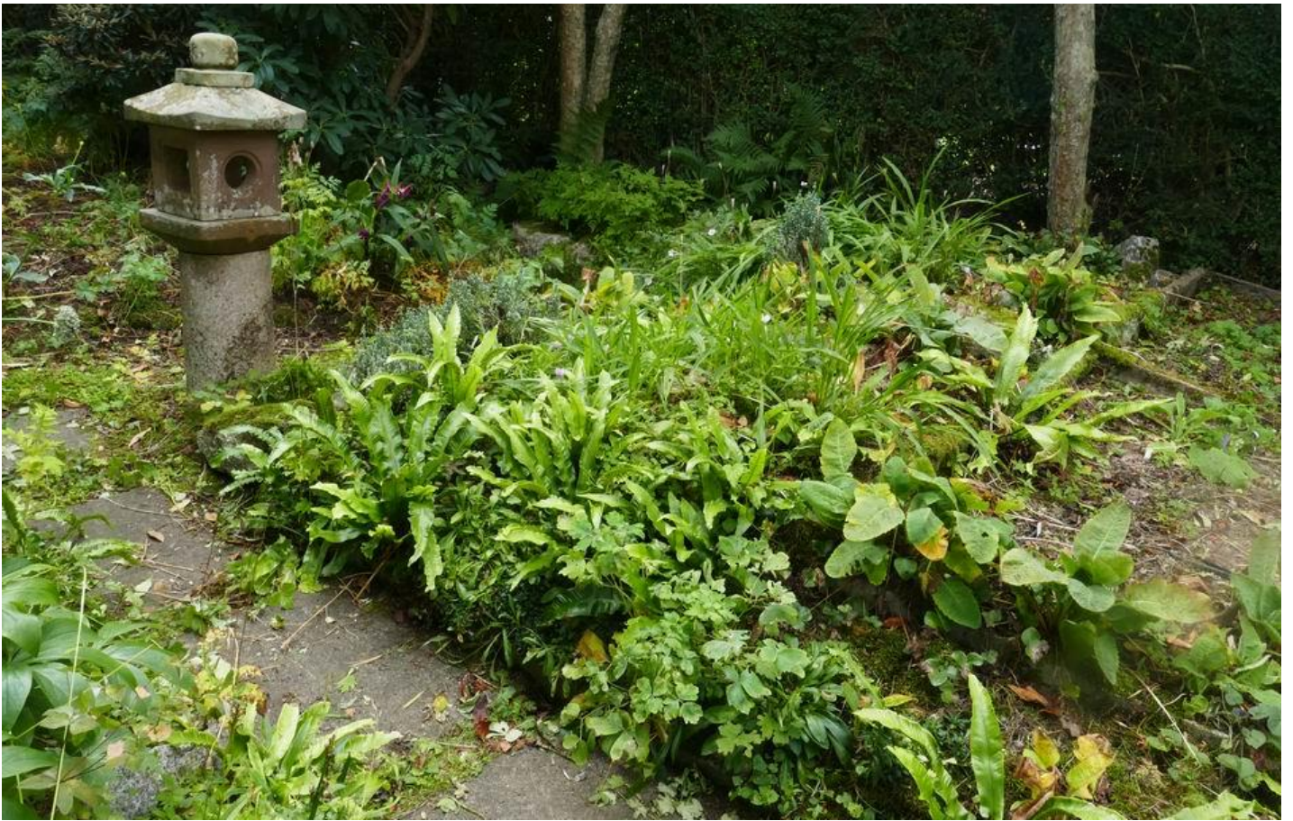
In the coming weeks more Crocus and Cyclamen flowers will join in the autumnal scene - in some cases sharing the space with still green foliage, in others taking over as the old growths have died back.