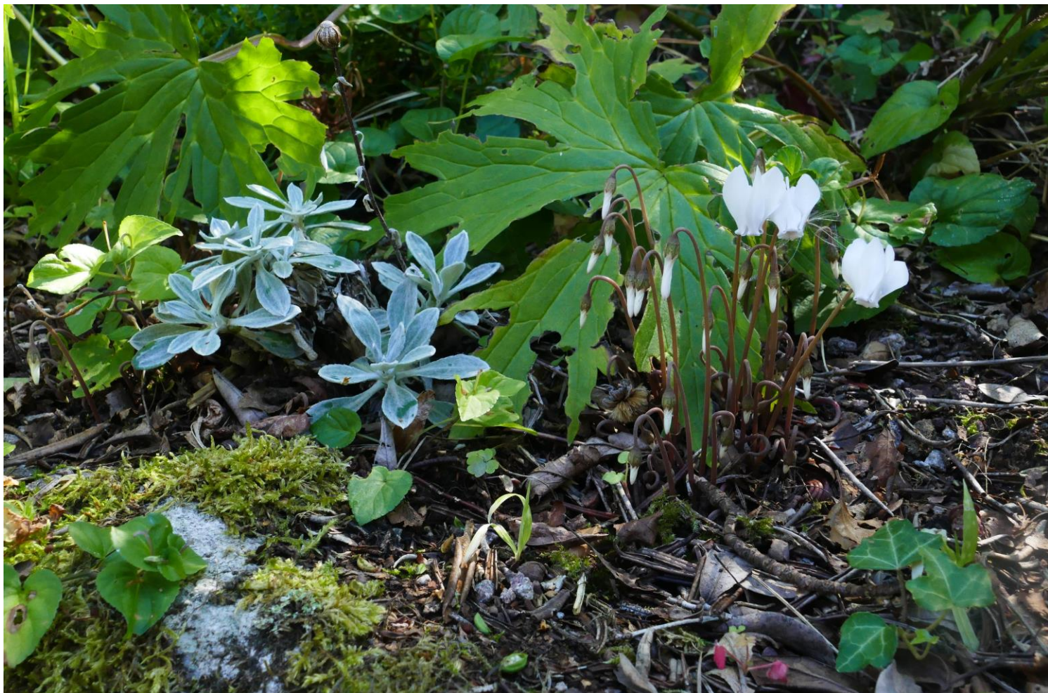
The silver leaves of Celmisia incana alongside a white form of Cyclamen hederifolium .